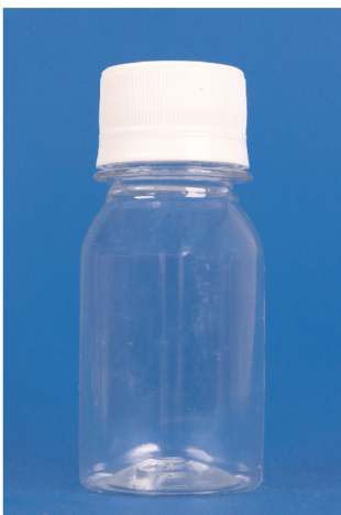
Ref: M3016 width: 3.1 cm capacity: 50 cc Hole Width: 28 mm Height: 8.2 cm Weight: 12 g