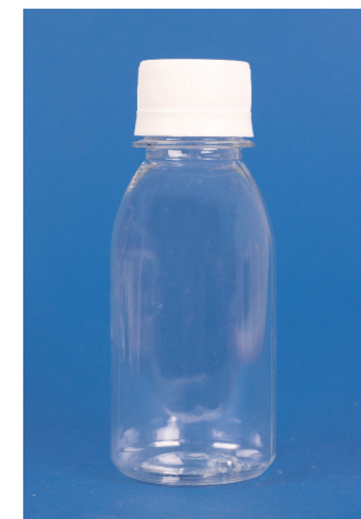
Ref: M3008 width: 4.7 cm capacity: 100 cc Hole Width: 28 mm Height: 10.6 cm Weight: 12 g/16 g