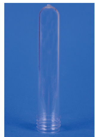
Ref: P4009 Hole Width: 24 mm Weight: 30 g