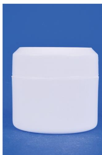
Ref: H904 capacity: 30 cc Height: 4.7 cm width: 5.1 cm Hole Width: 48.5 mm Weight: 20 g