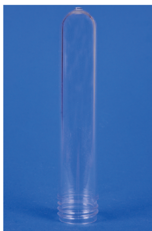
Ref: P4008 Hole Width: 24 mm Weight: 22 g