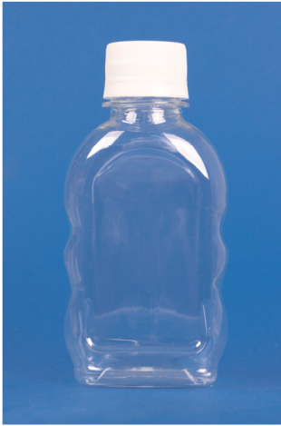
Ref: M3012 width: 5.8 cm capacity: 125 cc Hole Width: 28 mm Height: 12.3 cm Weight: 16 g