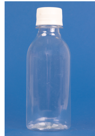
Ref: M3028 width: 5.3 cm capacity: 200 cc Hole Width: 28 mm Height: 14.3 cm Weight: 28 g