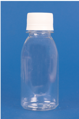
Ref: M3007 width: 5.5 cm capacity: 125 cc Hole Width: 28 mm Height: 11.1 cm Weight: 16 g