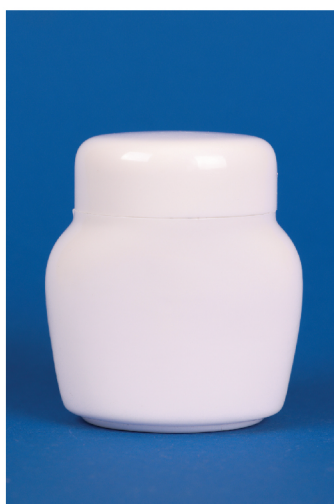
Ref: H903 capacity: 50 cc Height: 5.9 cm width: 5.2 cm Hole Width: 37 mm Weight: 15 g