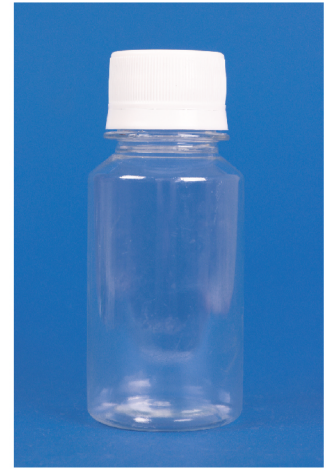
Ref: M3017 width: 3.8 cm capacity: 80 cc Hole Width: 28 mm Height: 9.3 cm Weight: 12 g