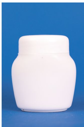
Ref: H902 capacity: 100 cc Height: 7.3 cm width: 6.2 cm Hole Width: 45 mm Weight: 23.5 g