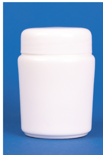
Ref: H905 capacity: 100 cc Height: 7.5 cm width: 5.3 cm Hole Width: 45 mm Weight: 23.5 g