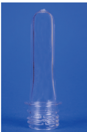
Ref: P4002 Hole Width: 28 mm Weight: 19 g