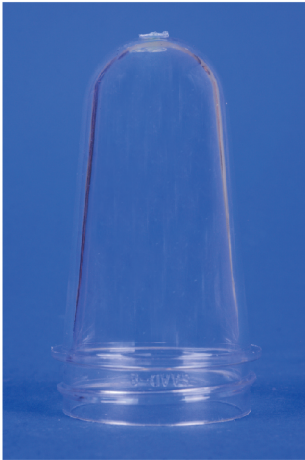
Ref: P4006 Hole Width: 32 mm Weight: 19 g