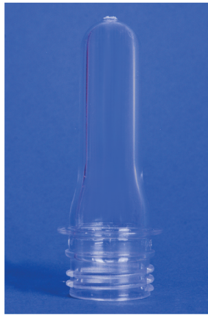
Ref: P4005 Hole Width: 28 mm Weight: 16 g