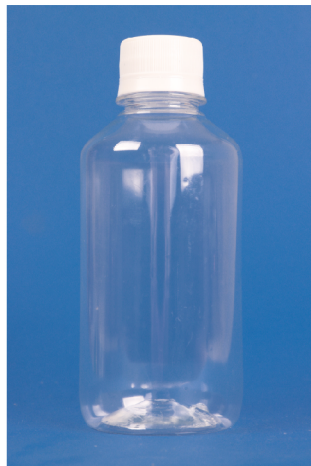
Ref: M3006 width: 5.6 cm capacity: 250 cc Hole Width: 28 mm Height: 13.6 cm Weight: 28 g