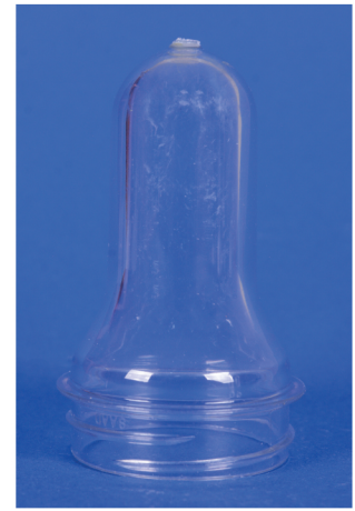
Ref: P4007 Hole Width: 32 mm Weight: 15 g