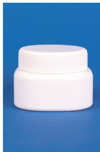
Ref: H906 capacity: 50 cc Height: 4 cm width: 5.6 cm Hole Width: 46 mm Weight: 15 g