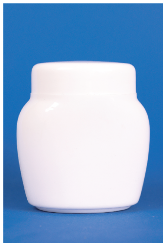
Ref: H901 capacity: 200 cc Height: 8.7 cm width: 7.8 cm Hole Width: 56 mm Weight: 38.5 g