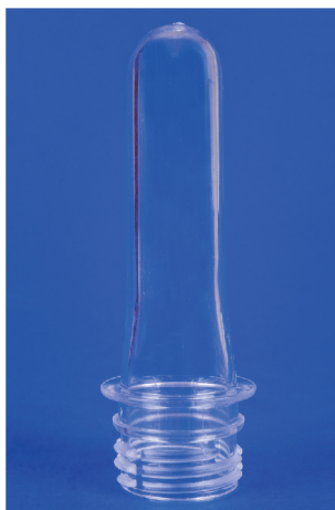
Ref: P4003 Hole Width: 28 mm Weight: 23 g