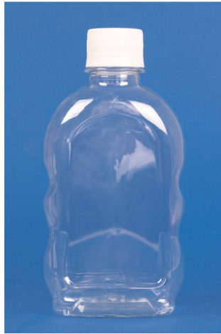
Ref: M3011 width: 7.5 cm capacity: 250 cc Hole Width: 28 mm Height: 15 cm Weight: 28 g