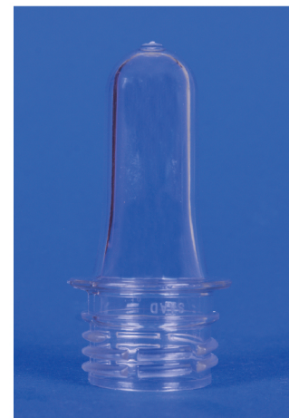
Ref: P4001 Hole Width: 28 mm Weight: 12 g